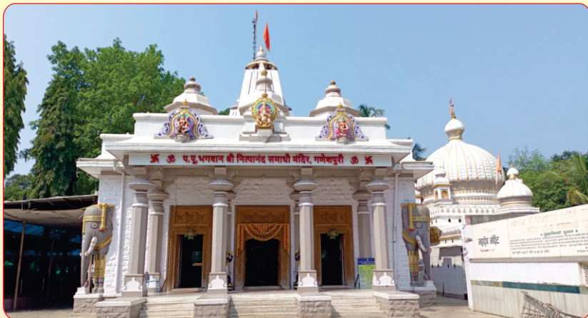
Shree Swami Nityanand Samadhi Mandir