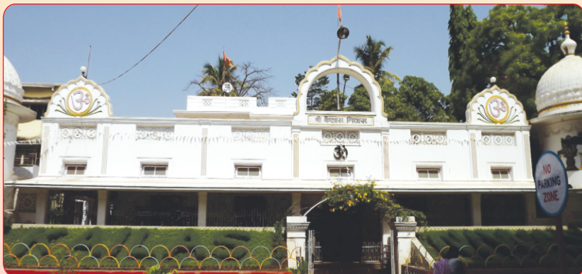
Kailas Niwas - Bhagawan Nityanand Niwas Sthan