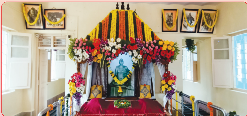
Bangalorewala Building - Bhagawan Nityanand Nirvan Sthan